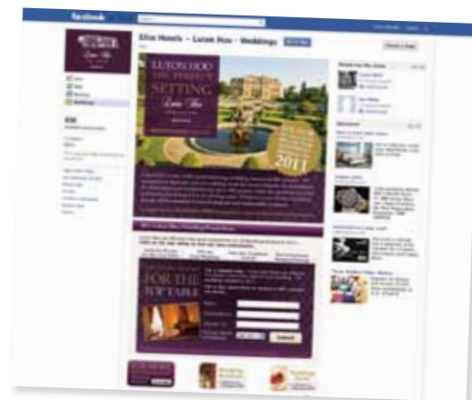
Our bespoke facebook tabs