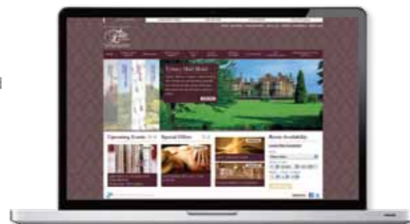
A new look website for Elite hotels